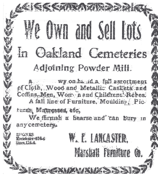
Map of Powder Mill Cemetery and Oakland Cemeteries showing original and currently maintained boundaries courtesy of Bill T. Whitis and Oakland Cemetery advertisement dated June 22, 1902 located by Ann Brannon.

Marshall City Cemetery. The Marshall City Cemetery got hit with a bad storm and a cedar tree was toppled and it broke the stones on some early graves.